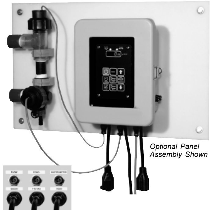
Optional Panel Assembly Shown